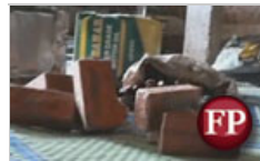
Thank Goodness Faisal Shahzad Didn't Go to This Bomb-Making Camp