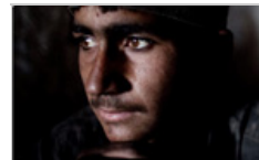
Fred Kaplan: New Report on Afghanistan Paints an Unyieldingly Bleak Picture