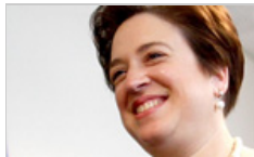
Slate Exclusive! A Preview of Elena Kagan's Supreme Court Questionnaire.